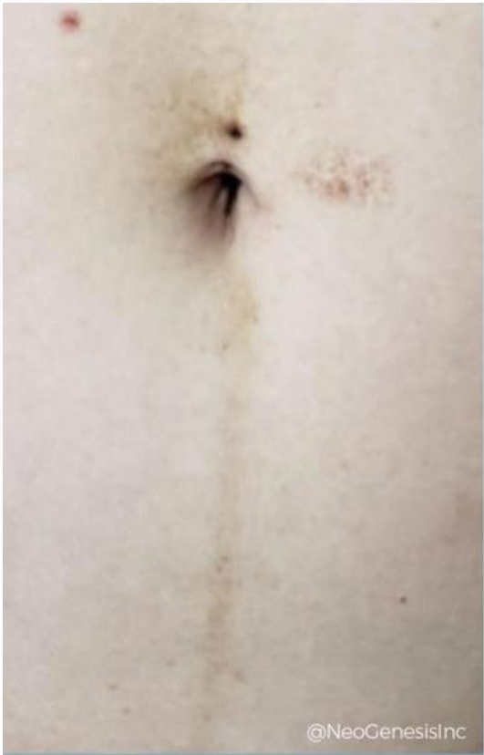
DAY 0 Scar under navel

Note: *the scar to the side of the navel is an old scar from a mole removed years ago and bonus part of this post pregnancy case study.