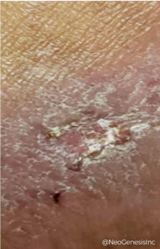
MONTH 14 OPEN WOUND DAY 60 using RECOVERY