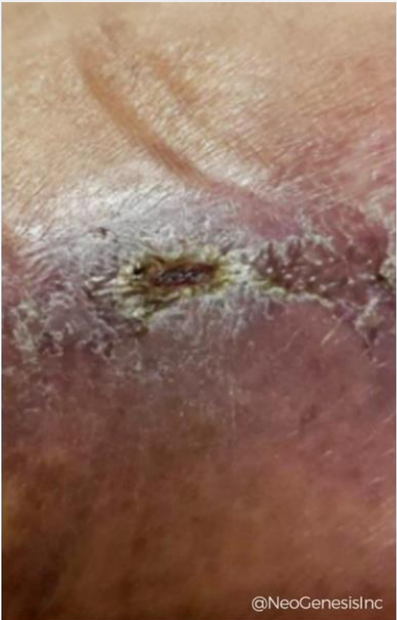
MONTH 13 OPEN WOUND DAY 30 using RECOVERY