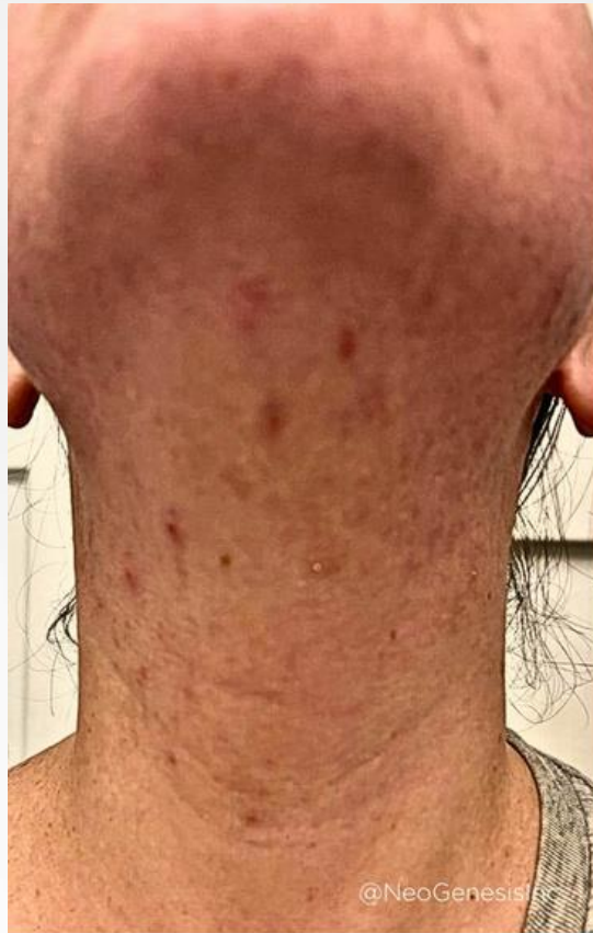
BEFORE JET PLASMA TREATMENT