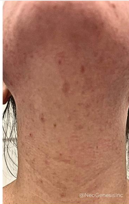
24 HOURS POST-JET